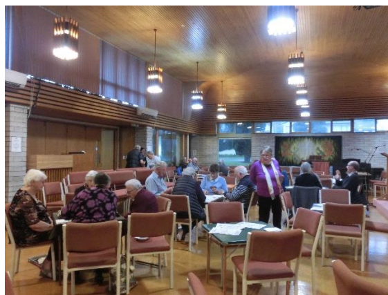
Getting together for fun and games