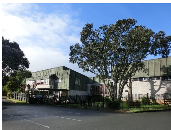
View from lower carpark

Please do not hesitate to contact the Link Person should you have any queries related to this vacancy.