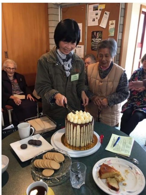
A special morning tea

Members of the Chinese congregation have an outreach among new immigrants into the country, helping them with paperwork and getting to know New Zealand culture.